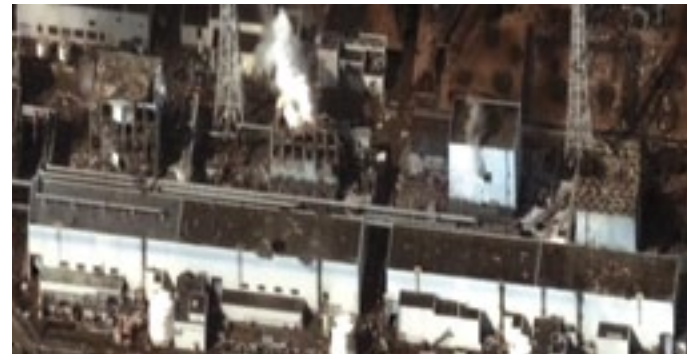
Fukushima smoldering after the March 2011 earthquake and tsunami.

The PAGs, for example, suggest allowing (indeed, forcing) the public to drink water with radioactive contamination vastly higher than EPA’s Safe Drinking Water Act limits. An analysis by Bridge the Gap of the proposed alternative drinking water limits show that they are as much as 27,000 times higher than what EPA currently deems safe! It is hard to conceive what ethical planet those who pushed for such weakened protections live on.