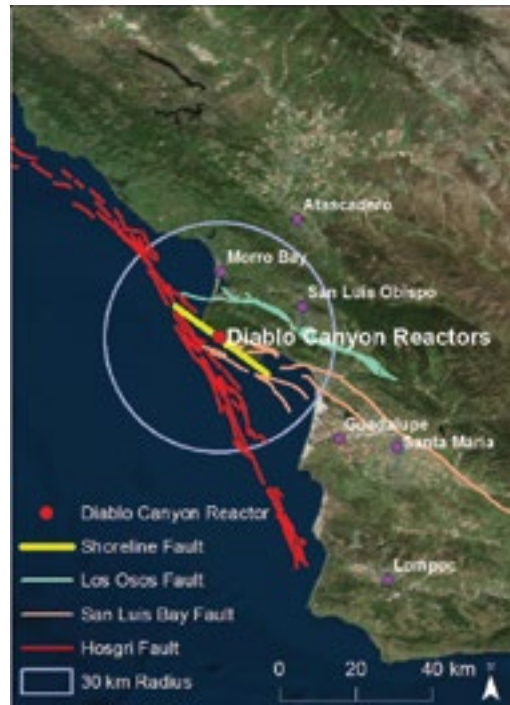
Now we know there are 4 active faults nearby.