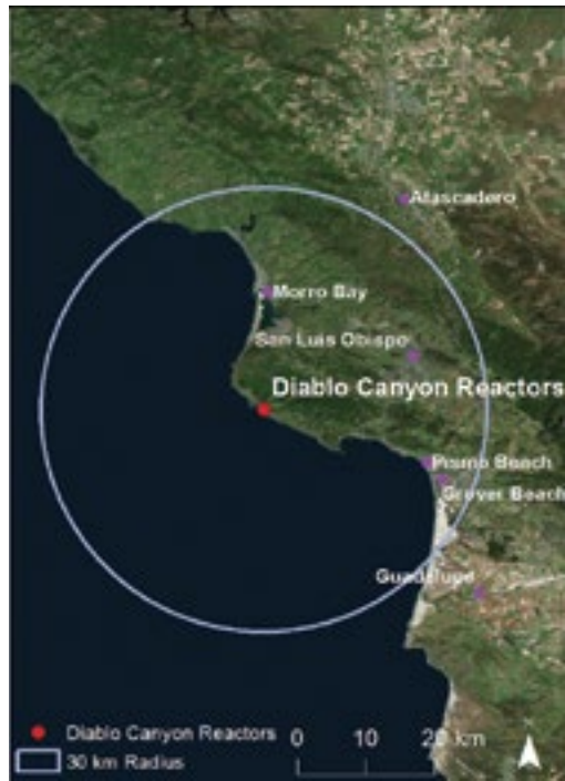
When Diablo Canyon was built, it was assumed there were no active earthquake faults within 30 km.

mistake. The struggle to prevent and then reverse the mistake has taken the commitment of many, many people, over many, many years. But soon, California will be nuclear free, and the world will be better off.