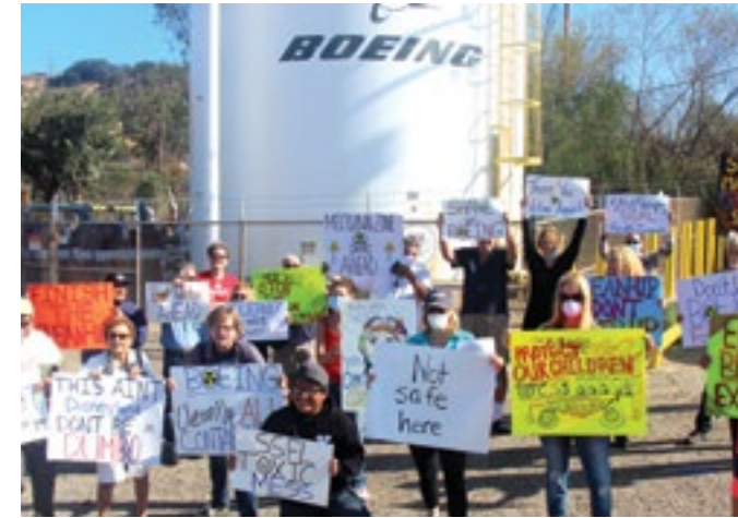
Protesters of all ages gather at Santa Susana Field Lab.

The fight over radioactivity in drinking water will persist. We will continue our work to prevent the public from having to drink water with radioactivity hundreds or thousands of times higher than has long been set as acceptable. Safe water is an undeniable right.