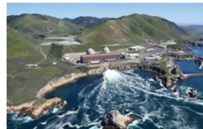
Aerial view of Diablo Canyon with visible fault topography

This is a result for which Bridge the Gap and many others have worked for decades. By 2025 California will be fully free of nuclear power and quite far along on the path away from carbon-based fuels as well. We are showing the world how to move from dirty and dangerous power—fissile and fossil—to safe, clean, renewable energy, with ramifications nationally and worldwide.